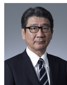
President Naohiko Kishi

Through Koshiraeru , we hone our specializations and implementing strengths and strengthen our customer activation powers. We are a professional collective of approximately 1,800 people who love Koshiraeru . At Hakuhodo Product's, we continue to work to be an integrated production company with ever stronger power to activate customers.